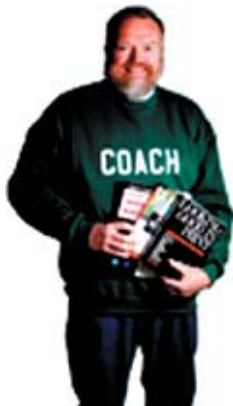
ROGER C. PARKER

Resaving your Acrobat file with its original filename reduces the size of the file